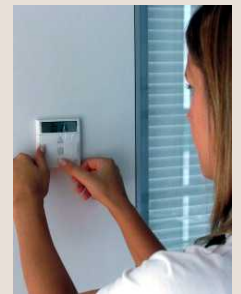
Motorised control blind system