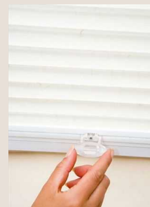
Pleated with concealed tension cords