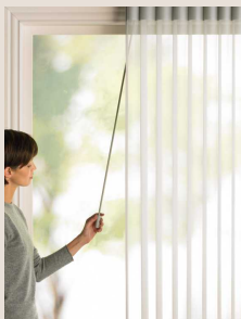
Wand operated vertical blind

When choosing new blinds for homes or places where children or vulnerable people live or visit, always look for a blind that is safe by design which does not contain cords or has concealed cords.