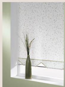
Sprung roller blind without pull cord