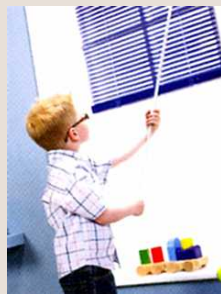
Crank operated gear blind